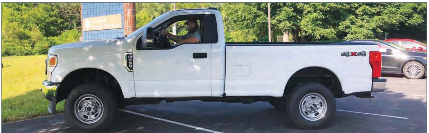
Our New Ford F-250 CSSW Packard Building