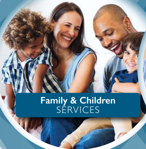
Family & Children SERVICES

Through compassionate service, we help people live meaningful and independent lives.