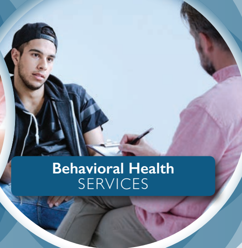
Behavioral Health SERVICES

4925 PACKARD ROAD | ANN ARBOR, MI 48108 | 734-971-9781