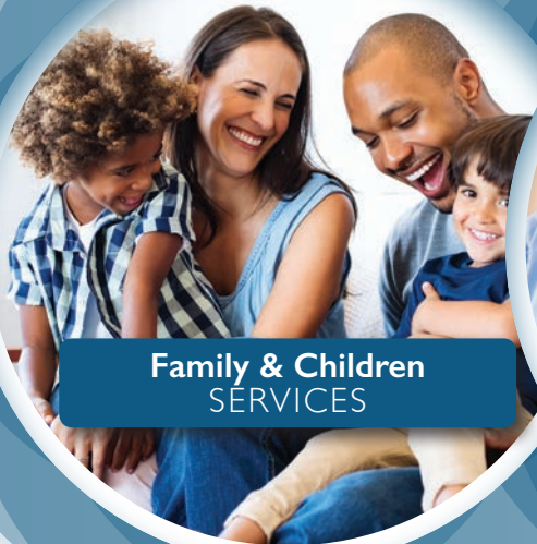
Family & Children SERVICES