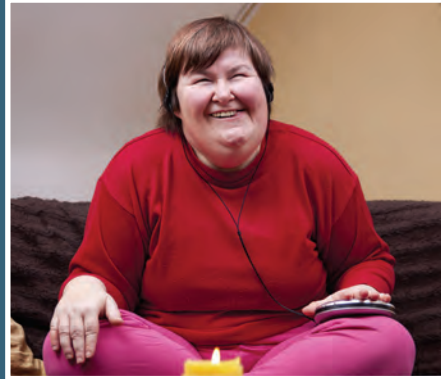
Living safely, productively, and with dignity...