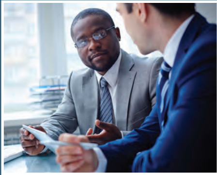
Helping ex-offenders find reliable housing and work...

We prevent new problems from occurring when we help people succeed