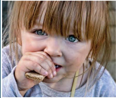
Having confidence that my family will not go hungry...

Without basic needs in place, it's difficult to make other progress