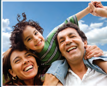
Practicing new skills for being a better parent or spouse...