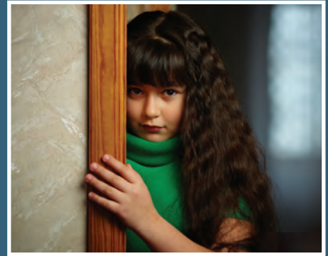
Establishing trust with those who have been hurt...