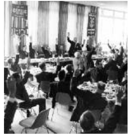
Ann Arbor Kiwanis 1959

what was good for GM truly was good for the country. A gallon of gas cost 25 cents. Barbie Dolls and Motown launched that year while families gathered around their black and