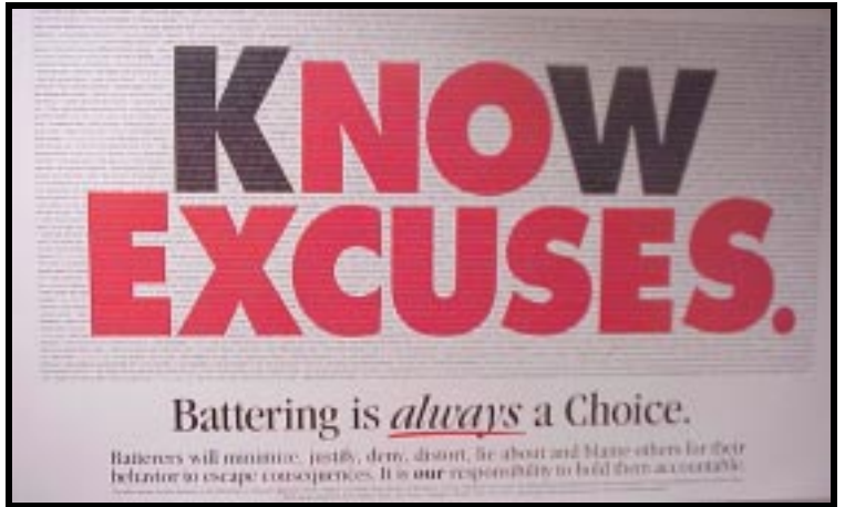
KNOW Excuses Poster